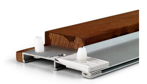
Figure 1. Finished threshold component for the frameset

Since only one of the threshold options is manufactured by JELD-WEN factory, more detailed manufacturing process of the thresholds has been left out of the graph. The manufacturing of the JELD-WEN threshold includes similar steps as the frame set manufacturing, as it undergoes the sizing, milling, surface treatment and assembling before used as a component to the frame set.