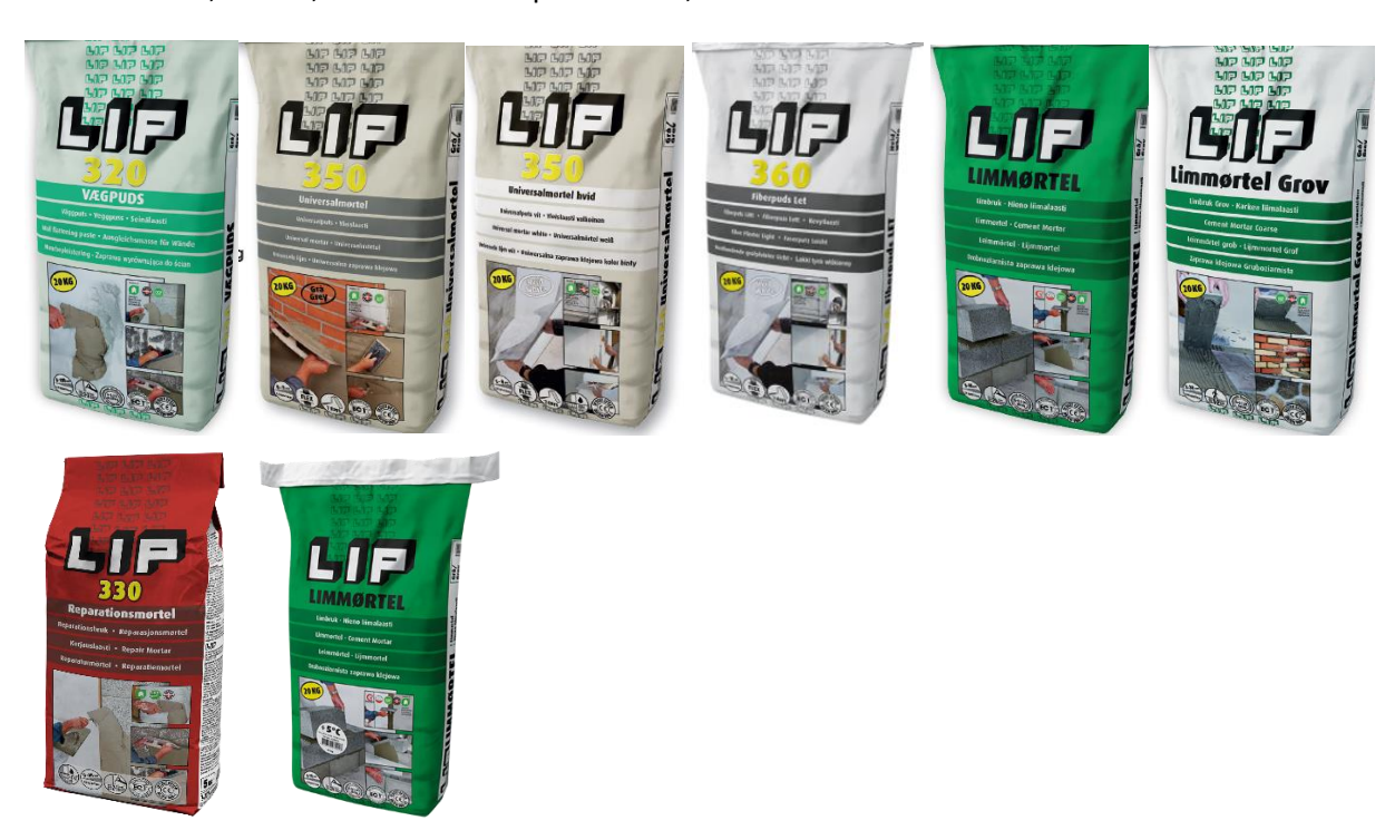
Figure 1: Pictures of the eight LIP wall plaster products covered in this project report.

LIP 320 Wall Plaster, LIP Wall Plaster, LIP 350 Wall Plaster, LIP 360 Wall Plaster Light, LIP Wall Adhesive, LIP Wall adhesive, coarse, LIP 330 Wall Repair Mortar, LIP Wall Adhesive -5.