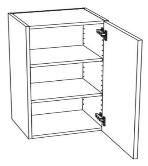
Figure 1, shows a picture of the solid wood kitchen door with lacquer Birka Ek and its application in a kitchen cabinet.