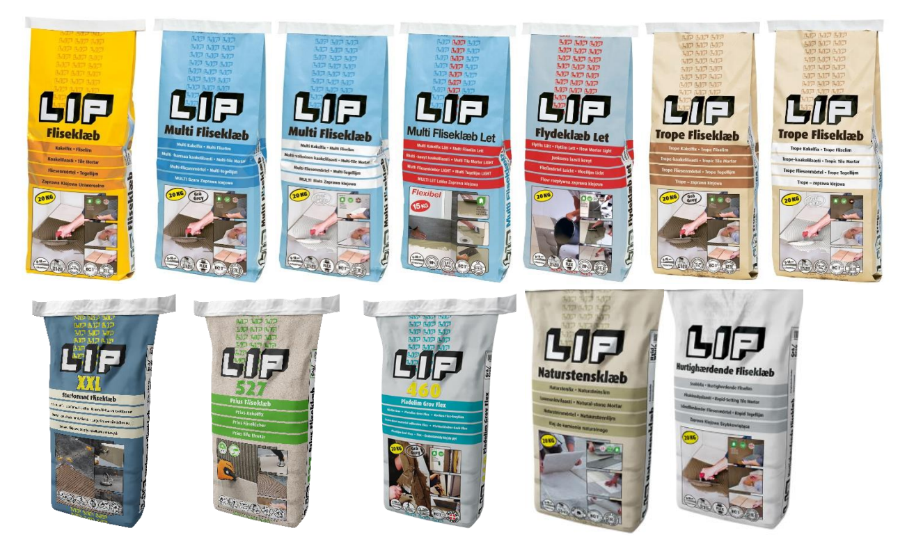
Figure 1: Pictures of the LIP products covered in this project report.

LIP Tile Mortar, LIP Multi Tile Mortar – Grey and White, LIP Multi Tile Mortar Light, LIP Flow Mortar Light, LIP Tropic Tile Mortar – Grey and White, LIP Tile Mortar XXL, LIP 527 Tile Mortar, LIP 460 Sheet adhesive coarse flex, LIP Natural Stone Grout and LIP Rapid-Setting Tile Adhesive.