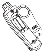
Figure4. Replacing the Battery